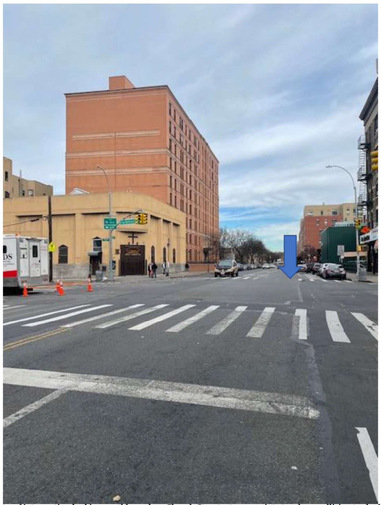
Photo of intersection looking northbound on Church Street. Arrow points to where collision took place