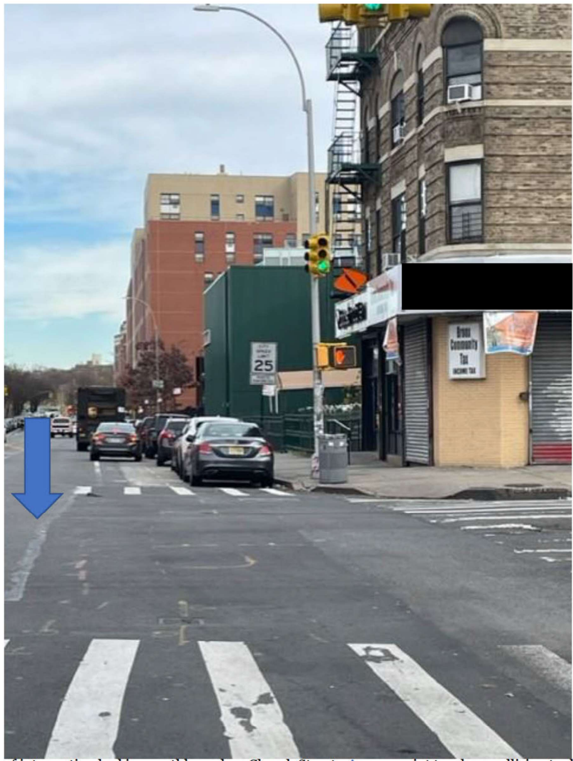
Photo of intersection looking northbound on Church Street. Arrow point to where collision took place