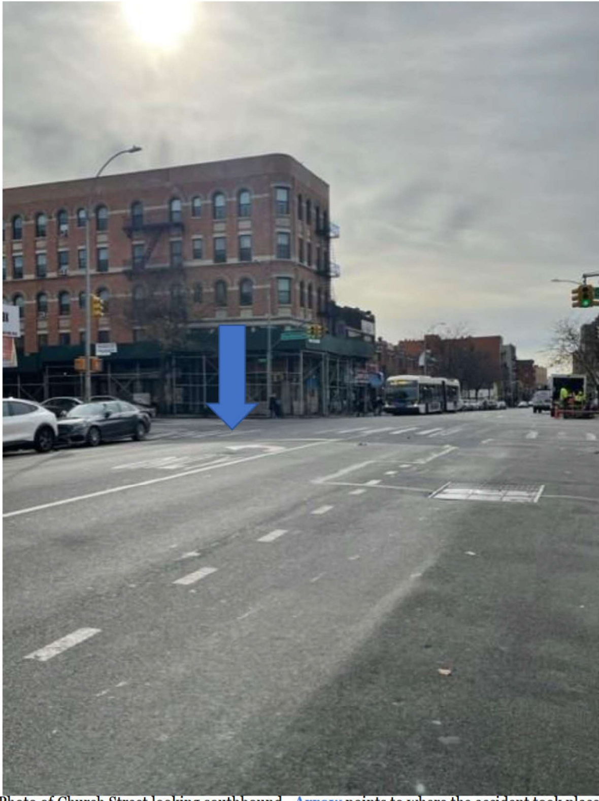
Photo of Church Street looking southbound. Arrow points to where the accident took place.